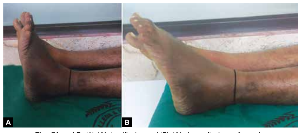
Figs 7A and B: (A) 10^{\circ} dorsiflexion and (B) 40^{\circ} plantar flexion at 6 months

Zimmer and Johnson summarized eight major series plus their experience and reported 79.5% medial, 17% lateral, 2.5% posterior and 1% anterior dislocations. Associated fractures were more frequently seen in lateral dislocations. They reported 25% open dislocations and 4 to 5% avascular necrosis.<sup>9</sup>