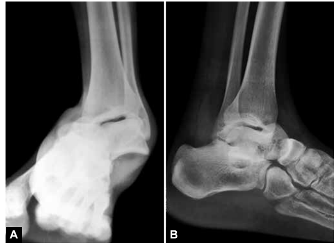
Figs 2A and B: Anteroposterior and lateral radiographs of total lateral talar dislocation