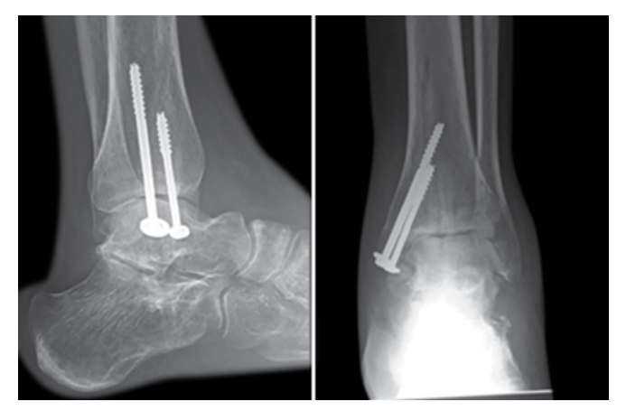
Fig. 6: Anteroposterior and lateral views of ankle after the Steinmann pin was removed