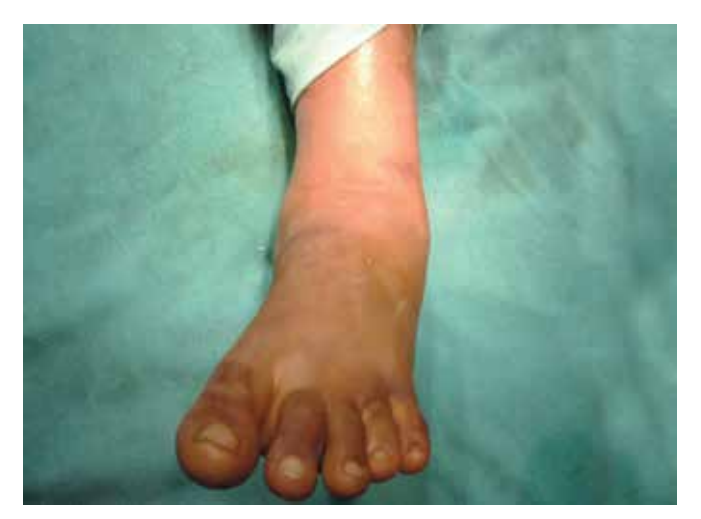
Fig. 1: Swelling over the left foot and ankle, and varus deformity of the forefoot

Showed pan-talar dislocation with fracture of the posterior process of the talus (Fig. 3).