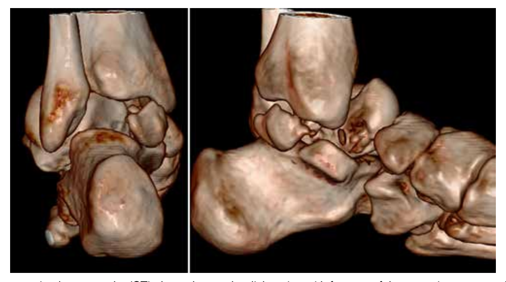
Fig. 3: Computerized tomography (CT) showed pan-talar dislocation with fracture of the posterior process of the talus