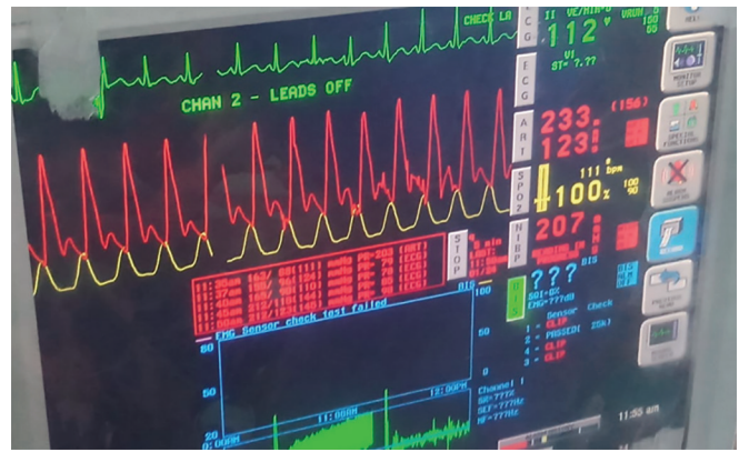
Fig. 2: Hypertensive response to stimulation

The patient was preoxygenated with 100% oxygen, induced with inj. propofol 100 mg, sevoflurane + oxygen, inj. rocuronium 30 mg was given, the patient intubated with a cuffed endotracheal tube of size 7.0, the bilateral air entry was checked, and the tube was fixed at 19 cm: BP 150/100 mm Hg and HR 118 bpm. The patient